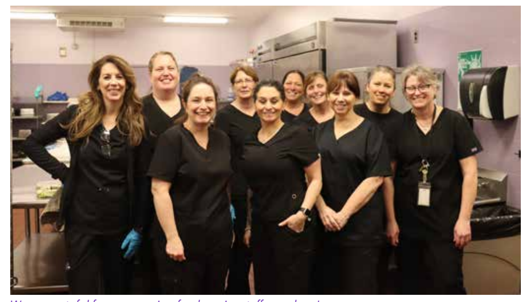
We are grateful for our amazing food service staff members!

welcome break to fuel up and boost our energy. We hope this article makes an impact and encourages Food Services to continue to offer these delicious meals. We all want to make a difference, even small ones. With one small difference at a time, we can all work to leave an impact. And with that impact, we can all change the world.